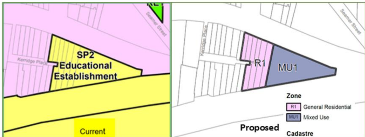
Figure 4. Existing and proposed zoning for the site

Figure 4 below is indicative of how this planning proposal would amend sheet LZN_009 of the Land Zoning Map as adopted by the Sydney LEP.