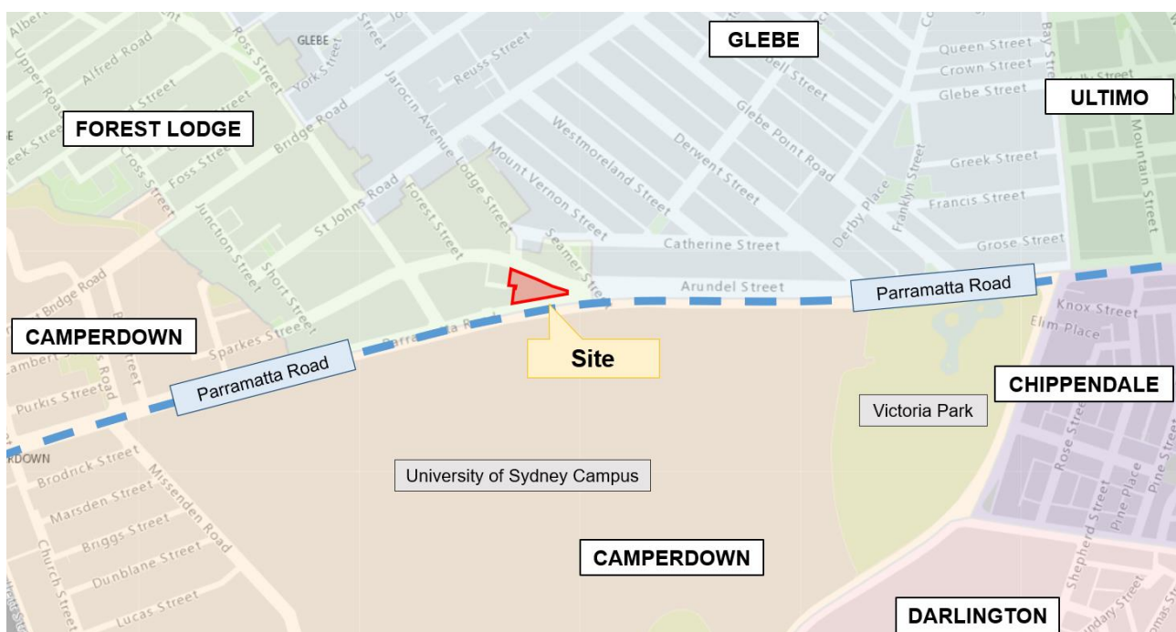
Figure 2. Site context and suburb boundaries

The properties are located within Forest Lodge, in close proximity to Central Sydney. The area north of the site is predominantly residential and development is characterised by typical Victorian one and two storey terrace houses. The area south of the site, across Parramatta Road, is the University of Sydney campus. The properties form an acute triangle shape at the intersection of Parramatta Road and Arundel Street. The context is shown in Figure 2 below.